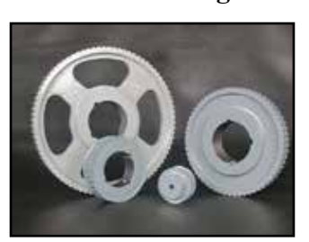
L & H Timing Pulleys