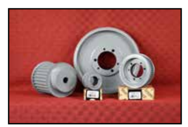
HTD Timing Pulleys